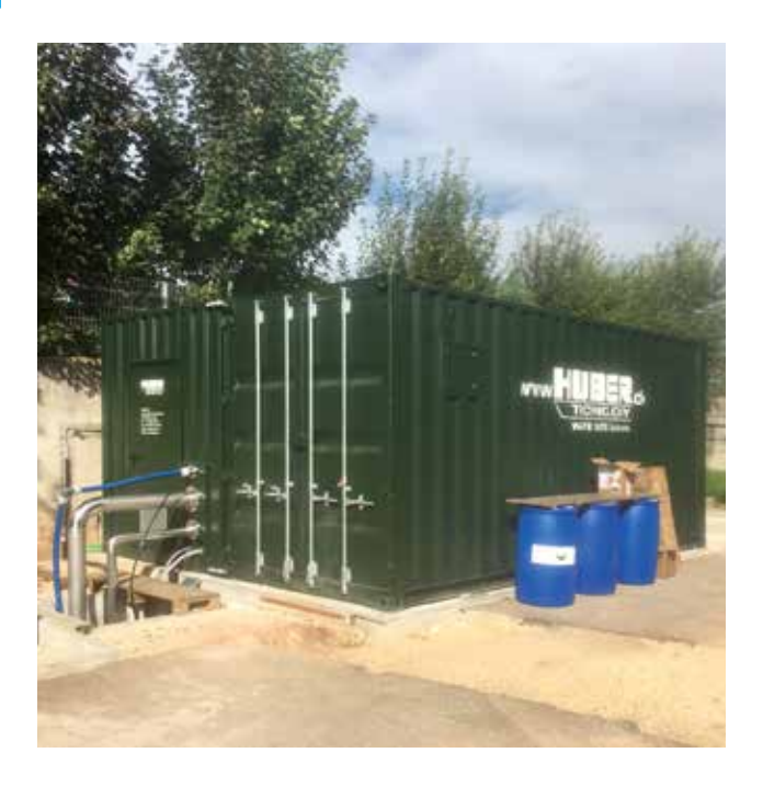
HUBER plant technology in container design – flotation or sludge dewatering units without construction work – ready for immediate use.