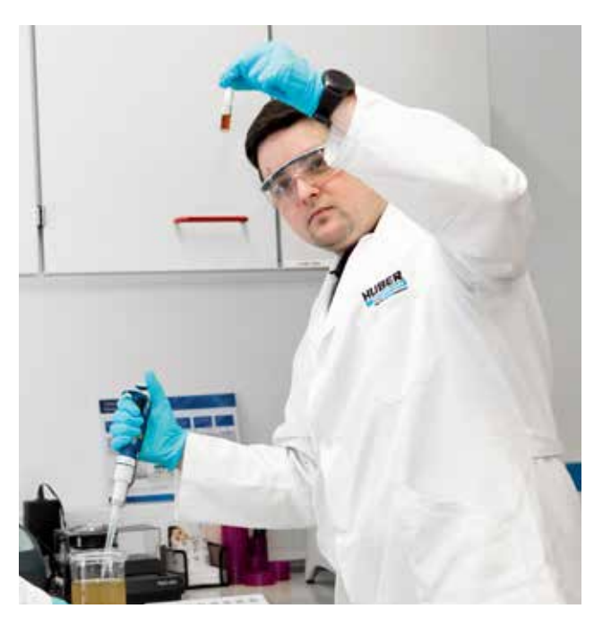
Preliminary tests in the laboratory or on site to determine operating parameters and effluent values – safety for customers and operators.