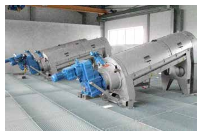
HUBER Screw Press units for sludge treatment – best dewatering performance and highest volume reduction for lower disposal costs.