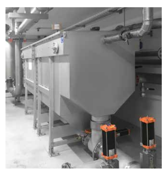
HUBER Heat Exchanger RoWin for heat recovery and wastewater cooling – energy optimisation and compliance with temperature limits.