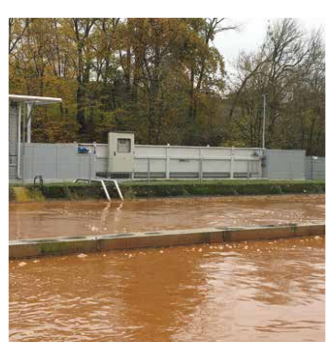
HUBER Dissolved Air Flotation systems for sludge separation and effluent treatment – the solution for upgrading overloaded wastewater treatment plants.