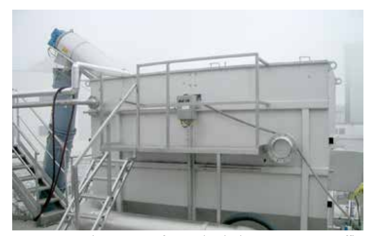
HUBER screening systems for mechanical pre-treatment – efficient, durable and well proven.