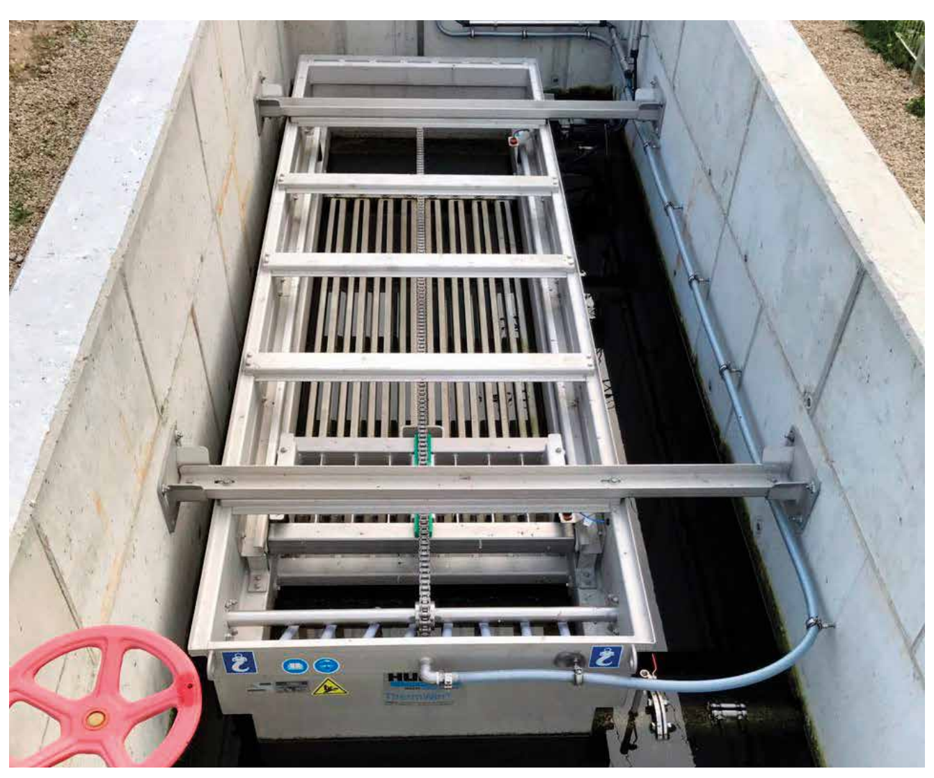
HUBER Heat Exchanger RoWin C installed in a concrete tank. The flow streams through the heat exchanger by gravity.

pumping energy is required. This avoids costs and significantly improves the economic efficiency of such plants. The HUBER Heat Exchanger RoWin C can make an important contribution especially to energy-efficient retrofitting of sewage treatment plants. Due to its compact design and installation in a channel or tank, no additional installation space is required and the available space utilised at an optimum. But biofilm growing on the heat exchanger surfaces cannot completely be ruled out with the use of the WWTP effluent. Integrated cleaning of the heat transfer surfaces therefore is of great importance to continuously maintain the maximum heat transfer capacity. Several HUBER Heat Exchanger RoWin units can be installed in parallel or in series for perfect adjustment to specific site conditions and customer requirements. Combined with load-bearing covers the units can also be installed under parking areas for example.