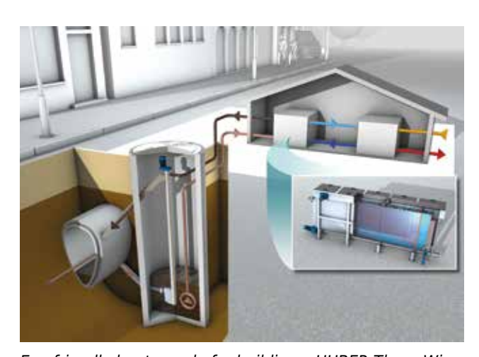
Eco-friendly heat supply for buildings: HUBER ThermWin system with HUBER Heat Exchanger RoWin.