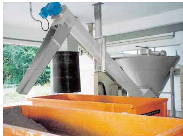
A classifying screw transports the grit from the separation room into a skip.