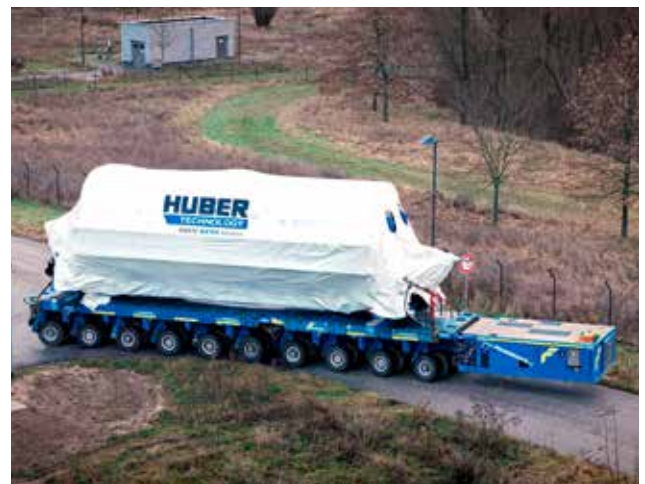
Transport of a disc dryer to the installation site.