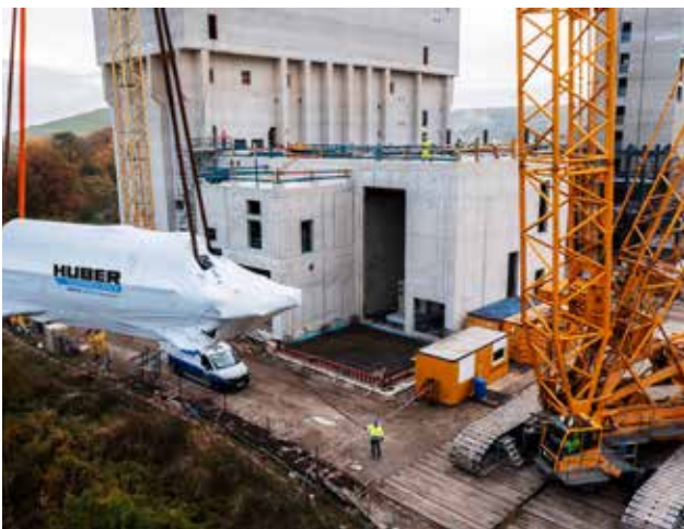
A disc dryer is lifted into place with the help of a heavy-duty crane.