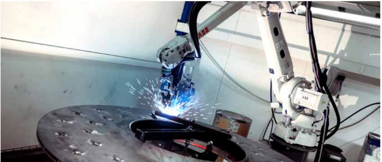
Robot-manufactured discs ensure identical high quality.

Reliable condensate drainage from the discs due to the omission of a syphon pipe