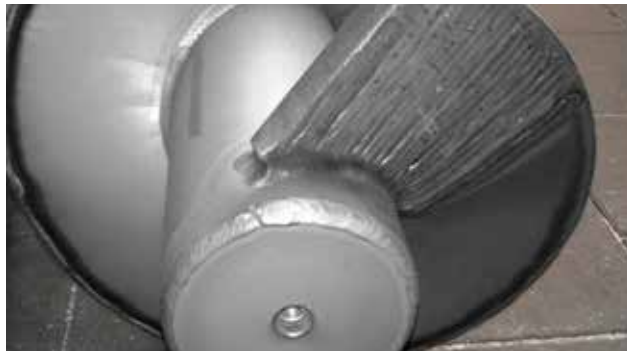
Screw shaft in new condition.

Interested in retrofitting the HUBER Wash Press Wear Detection? Do not hesitate to contact HUBER Global Service – the retrofit can be combined with a maintenance visit to save costs.