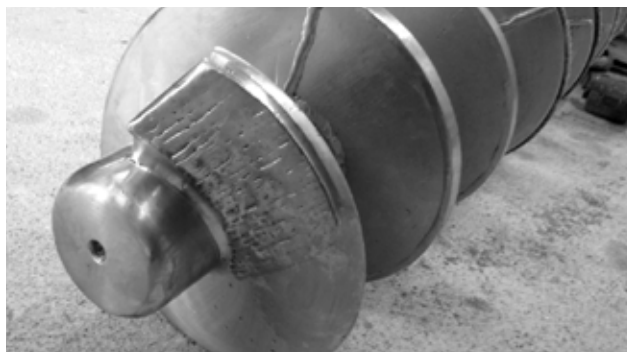
Advanced wear on a screw shaft.